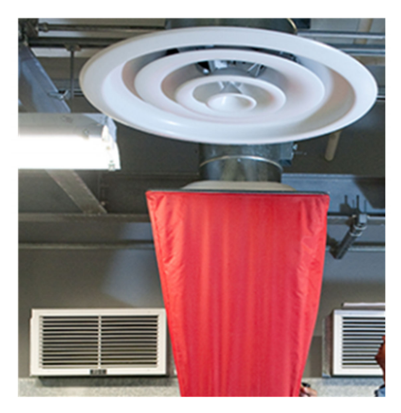
Figure 1 Testing and balancing of HVAC airside components.