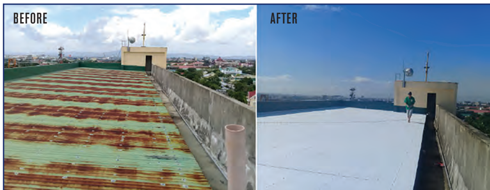
The roof at Naga College in the Philippines before (left) and after (right) becoming a cool roof, which reduces the absorption of external heat and the need for air conditioning in buildings.

The Challenge is a project of the Kigali Cooling Efficiency Program (K-CEP) in collaboration