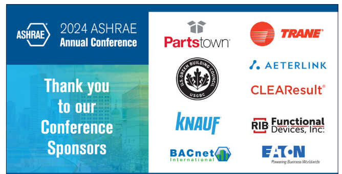
SOCIAL MEDIA THANK YOU POST Graphic with chapter logo, sponsor logo, and a thank you message.