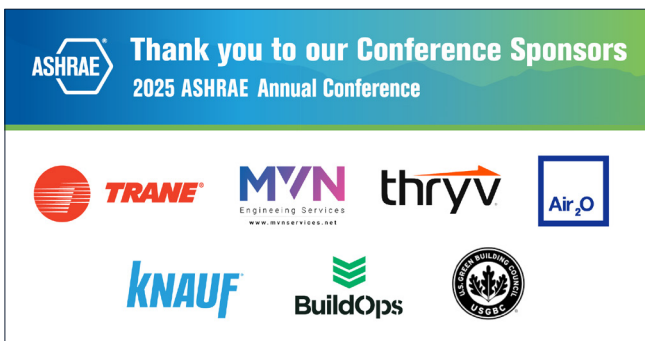
THANK-YOU SLIDES PowerPoint slides to display acknowledgment for sponsors before and after event.