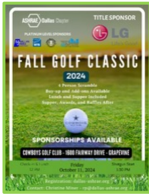
EVENT PROMOTION SOCIAL POSTS Templates to announce sponsored events with sponsor logo.