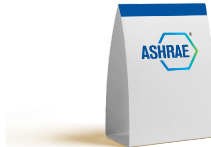
EVENT TABLETOP SIGNAGE Editable design for sponsor logos and messaging.