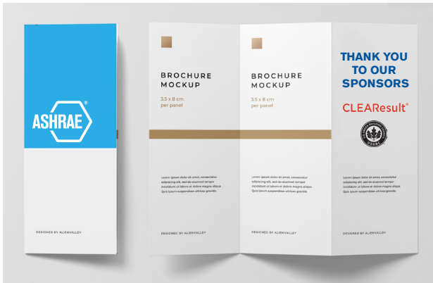
EVENT PROGRAM FLYER Include space for sponsor logos and recognition text.