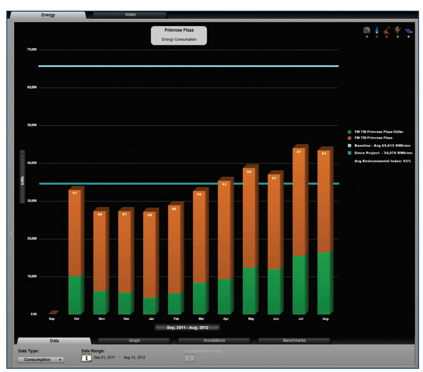
Figure 2: An energy reporting package screenshot of Primrose Plaza showing the energy savings resulting from a controls upgrade. The image has been annotated to include energy data from before the upgrade, as electronic metering was installed as part of the project. Occupant comfort is maintained even in the hottest months, as indicated by the average environmental index of 93%.

reset control strategies. That was enough to reduce energy use in most fire stations from 17% to 26%, without any adverse effect on the firefighters who live and work in these facilities.