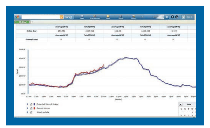
Figure 1: Real-time energy use (red) and baseline (blue) provided by demand response automation software for a fulfillment services company in California.

Opting into an automated demand response program based on the OpenADR specification, which will establish a com-