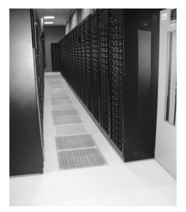
Figure 2.70 Rack layout showing the cold supply-air row.